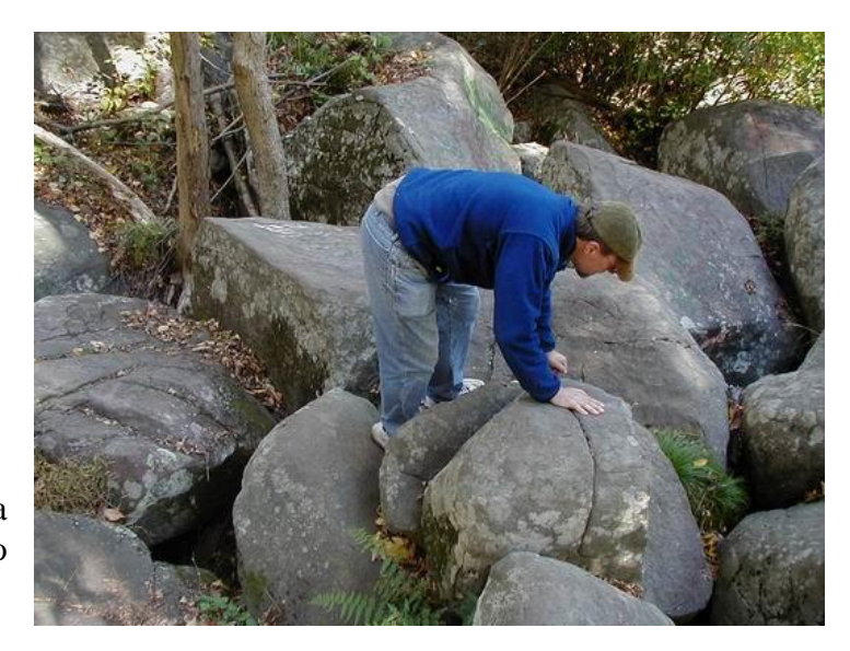
Boulders We can see this even more clearly if we look at a boulder field where the gaps are big enough to climb into.

If we look closely at the grit you can see how it opens up a mixture forming air spaces between the irregular shapes.