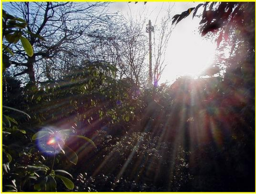
High noon 2005

This is as high as the sun gets in Aberdeen at this time of year; it hardly touches the garden as it does not rise above the trees. I wish you all a very good bulb growing year with many pleasures to come – one thing about growing bulbs is that there are always plenty delights and surprises.